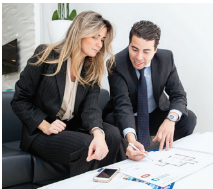
Promoting the professional fulfilment of Group employees

The Group's Corporate Social Responsibility (CSR) policy is integrated into its commercial strategies, as a means of leveraging performance and providing a source for inspiration and appeal. It is aimed at reconciling long-term global challenges with the current economic context.