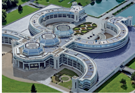
Improving environmental performance (Above: Challenger, Bouygues Construction's headquarters, a positive-energy building)